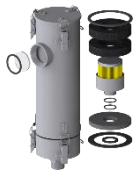
Exemplary representation of the spare parts set